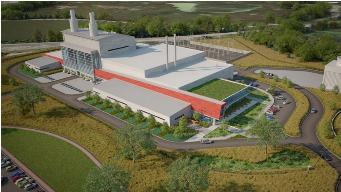
Figure 2-2 Architectural and Site Design Rendering

See rendering below of the conceptual design of the Facility.