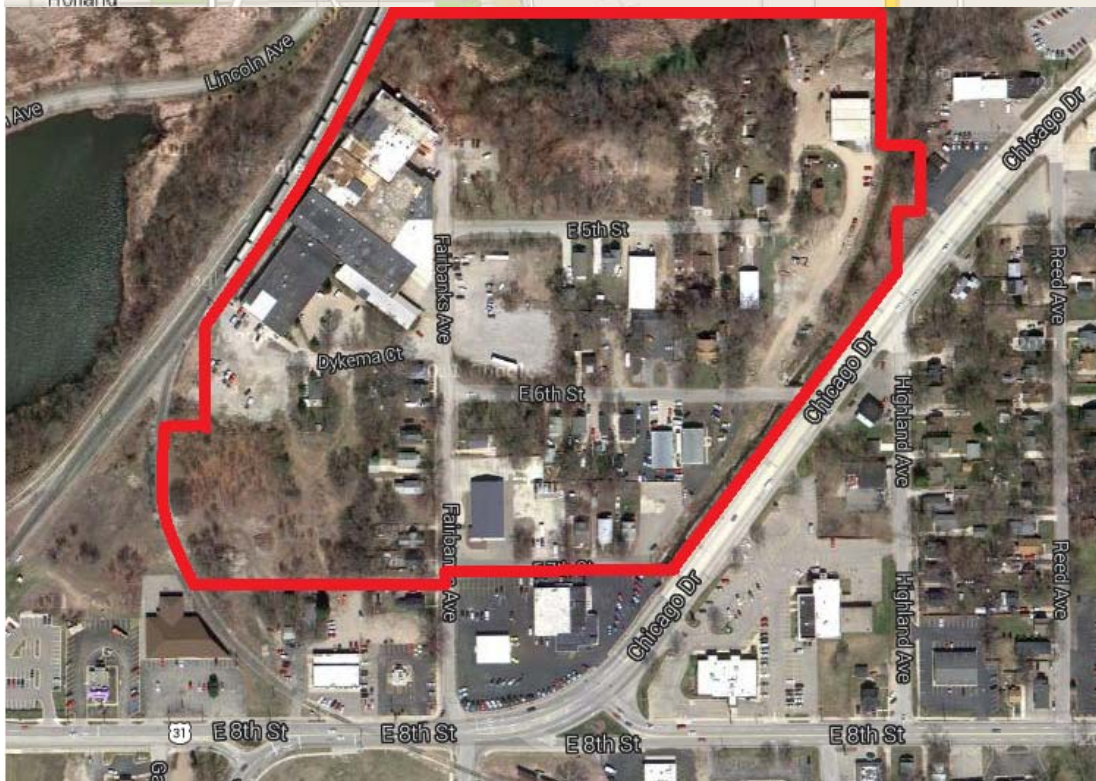
Figure 2-1 Site location maps